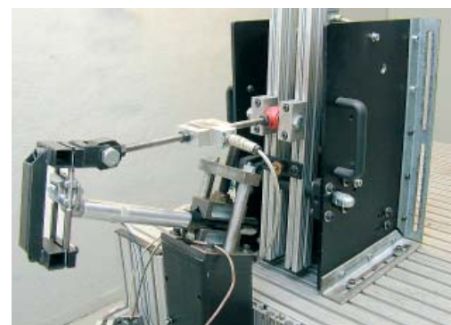
Fatigue testing of seat-pillar