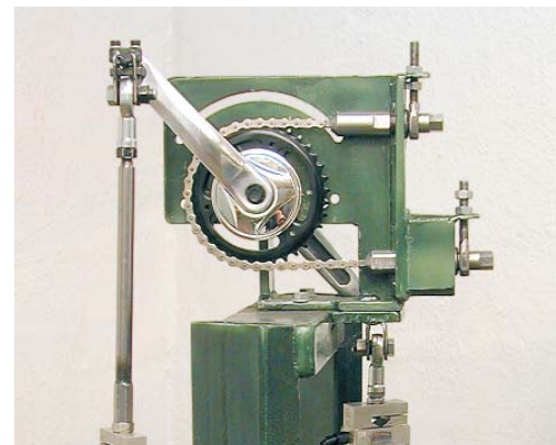
Fatigue testing of crank assembly