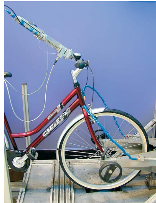
SMP's brake-test rig