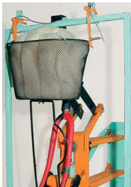
Fatigue test of front-mounted basket