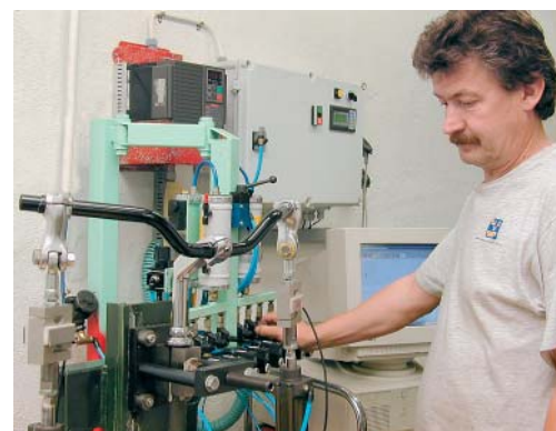
Fatigue testing of handlebar/handlebar stem