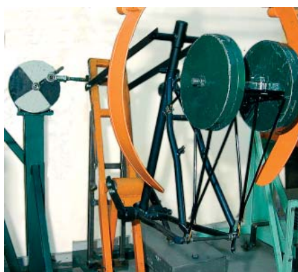
Lateral fatigue test of attachment points on frames