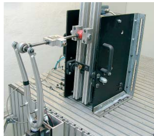
Fatigue testing of front forks

Apart from the test rigs for fatigue tests, SMP has equipment and machinery for various static tests and impact tests of frame, fork, handlebar-stem, drive-system, brakes, chains, dynamos, gear-shifting systems etc. New equipment is continuously developed to fit the needs of SMP's customers.