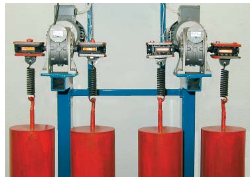
Fatigue testing of pedal spindles