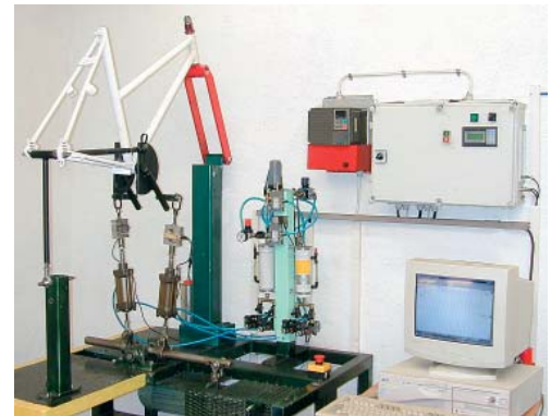
Fatigue testing of frames